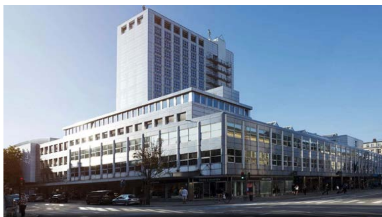
Hotel Scandic Falkoner