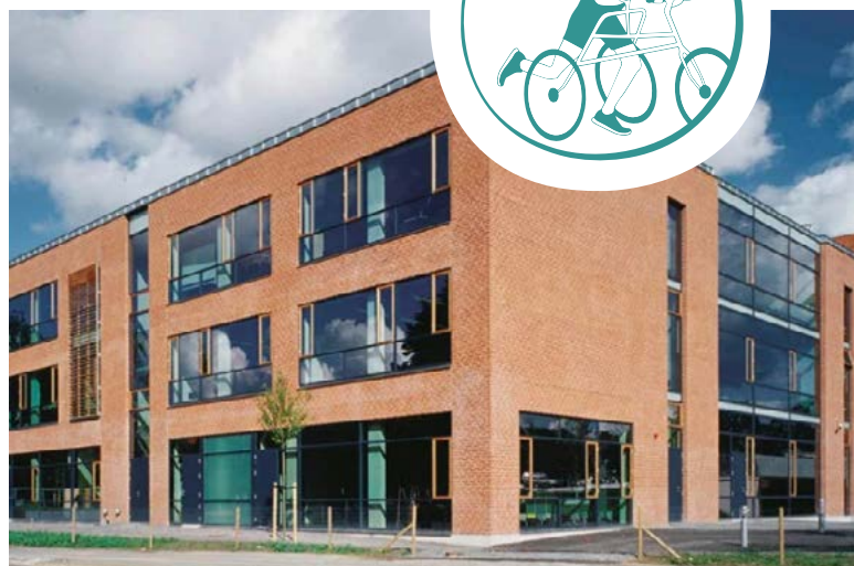
Hotel Scandic Sydhavnen

If you choose accommodation at the school or Hotel Scandic, we can offer transportation to and from the airport. The price for this is not yet determined. If you are interested in transportation, please indicate this when registering. You will later need to fill out and pay for the transportation through a separate transport form.