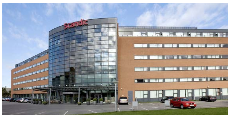
Hotel Scandic Sydhavnen